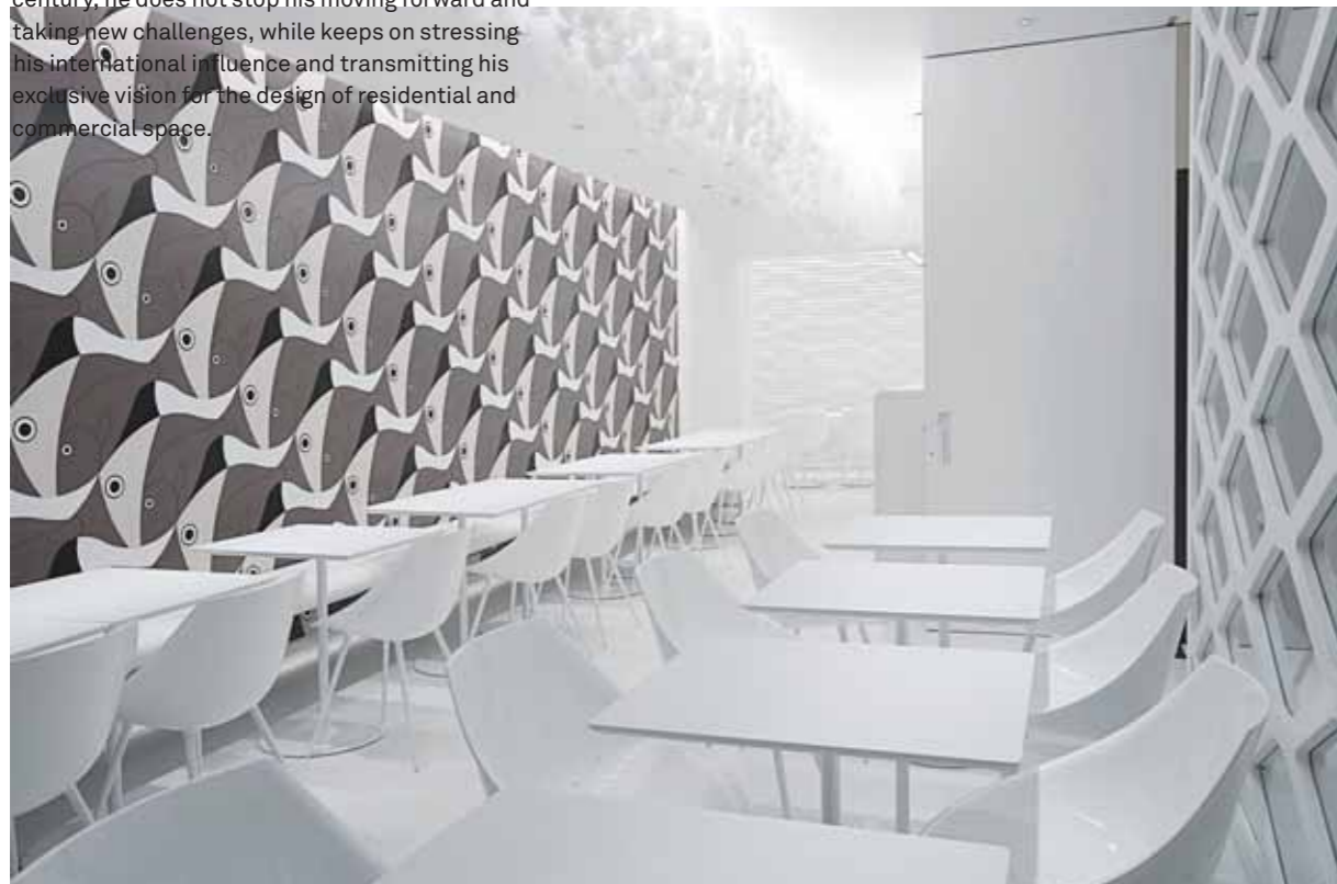
Design 360° / N.20 / 03.2009